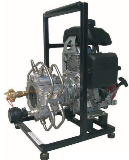
VD14-B (petrol engine)

Air Compressor VD 14-E: item number 106170