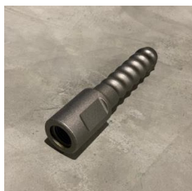
354523 External thread R 25 to internal thread M 27