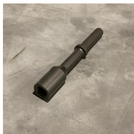
354510 Drive head HEXAGONAL 25 x 108 ID 25,5