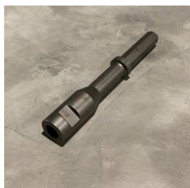
354538 Drive head HEXAGONAL 25 x 108 IT R25 right