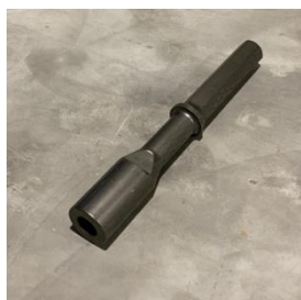
354529 Drive head HEXAGONAL 32 x 160 IT R25 right