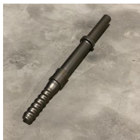
354549 Drive head ROUND 25 x 108 ET R25 right