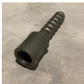
354552 External thread R 25 to internal thread M 30