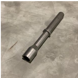
670004 Adaptor HEXAGONAL 32 x 160 mm mounted