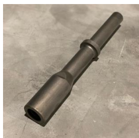
354536 Drive head ROUND 25 x 108 IT 25 right