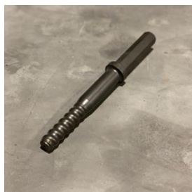
354548 Drive head HEXAGONAL 25 x 108 ET R25 right