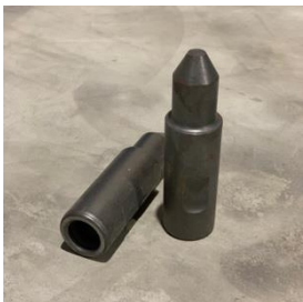
354516 Rod adaptor 32 x 150 flush top to 25 ET right