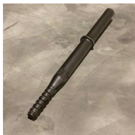
354513 Drive head ROUND 32 x 160 ET R25 right