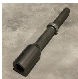
354541 Drive head ROUND 25 x 108 ID 25,5