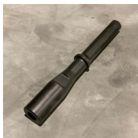
354533 Drive head ROUND 32 x 160 IT R25 right