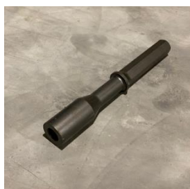
354512 Drive head HEXAGONAL 32 x 160 ID 25,5