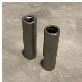
354514 Adaptor IT HD 25 RIGHT to IT M22