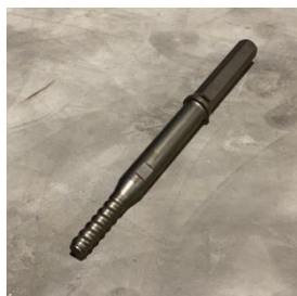
354528 Drive head HEXAGONAL 32 x 160 ET R25 right