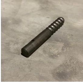
354511 Rod adaptor 25 x 185 flush top to 25 ET right