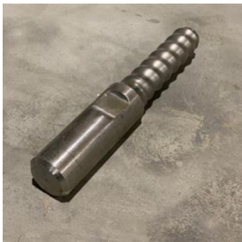
354516 Rod adaptor 32 x 150 flush top to 25 ET right